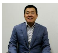
Former Yomiuri Giants Manager Mr. Tatsunori Hara