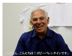
Former Boston Red Sox Manager Mr. Bobby Valentine