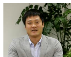
Professional Wheelchair Tennis Player Mr. Shingo Kunieda