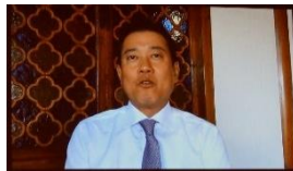
Yomiuri Giants Coach Mr. Tatsunori Hara