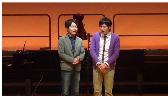
Japanese Comedian Duo Bakusho Comedians