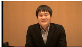
Wheelchair Tennis Mr. Shingo Kunieda