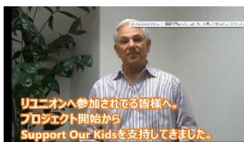
Former Boston Red Sox Coach Mr. Bobby Valentine