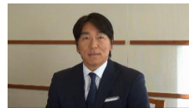
Former NY Yankees Mr. Hideki Matsui