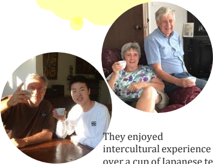
They enjoyed intercultural experience over a cup of Japanese tea.

Host families supported us for two weeks.