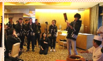
▶▶▶▶ Workshop of Japanese Food (rice cake))