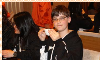
▶▶ Japanese Tea Ceremony