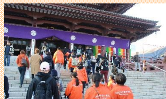
▶ Zōjō-ji temple