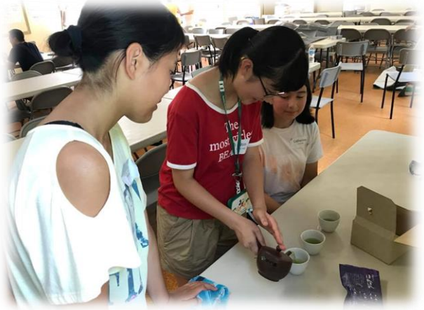
Introduction of Japanese Green Tea