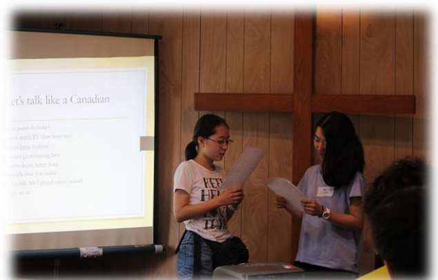
Talk Like a Canadian