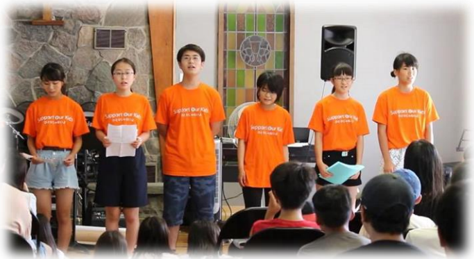
Recovery Support Song 「Flowers Will Bloom」