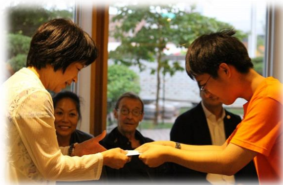
Messages from SOK participants to the Supporters