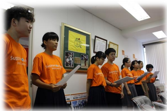
Earthquake Disaster Presentation