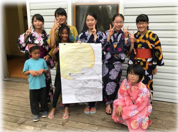
Different Cultural Experience