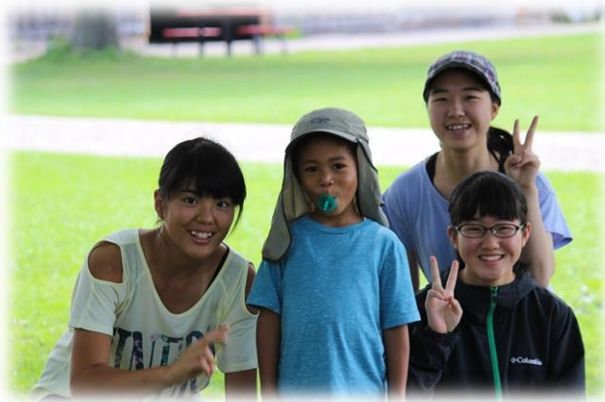
Interaction in Free Time