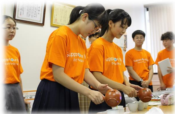
Japanese Tea Presentation