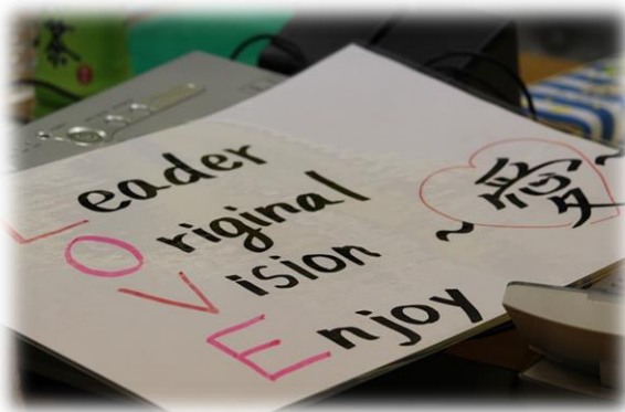
Setting Team Goals