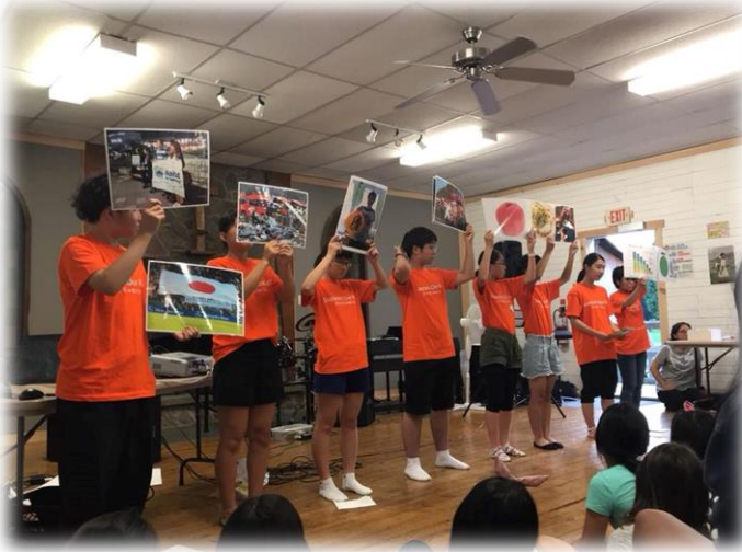
Earthquake Disaster Presentation