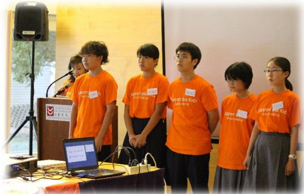
Flowers Will Bloom