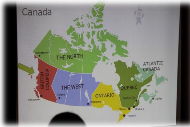
Geography of Canada