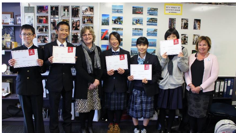
Homestay : Lincoln School : Lincoln High school