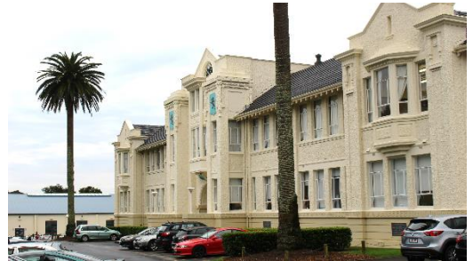
School / Presentation about the earthquake