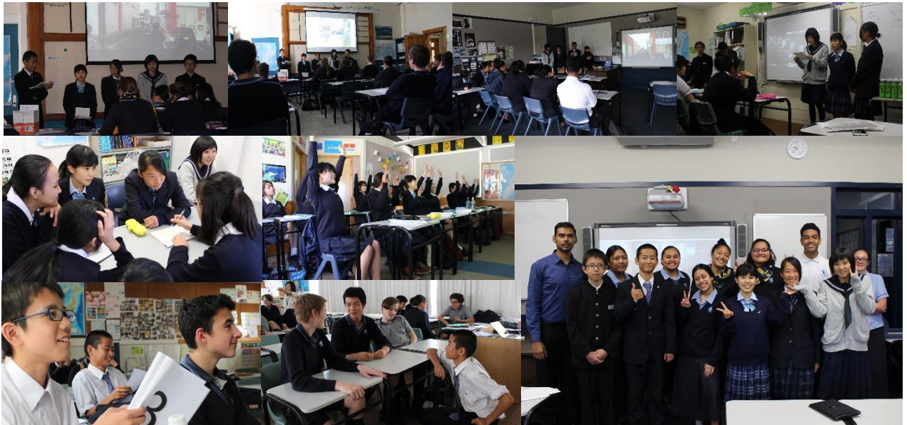
School Event (Cultural Evening)