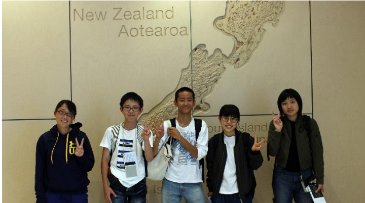
Homestay : Mount Albert School : Mount Albert Grammar School