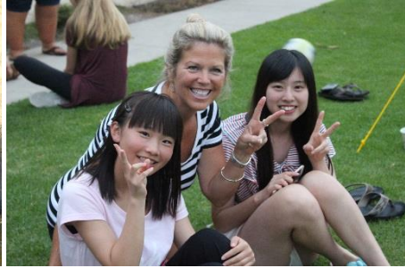
Los Angeles Family!