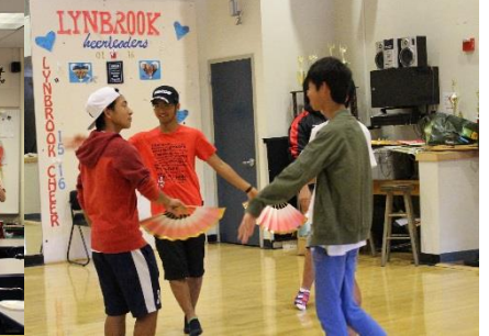
With Lynbrook High School students