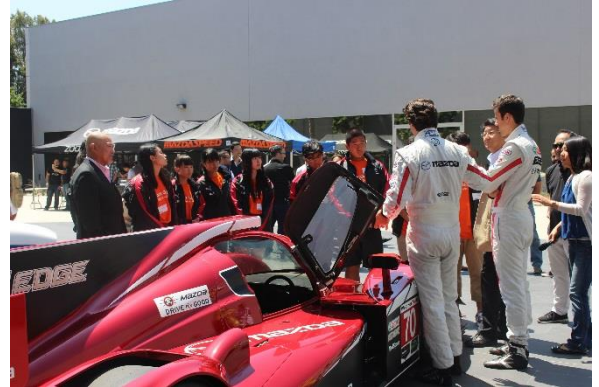
Visit to Mazda North America Operations R&D in Irvine