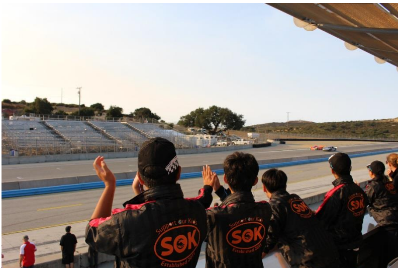
Cheering for Mazda 767b in the Pre- Reunion race event!