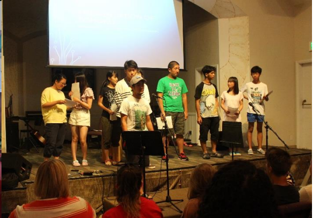
With the Seal Beach Grace Community Church Youth Group