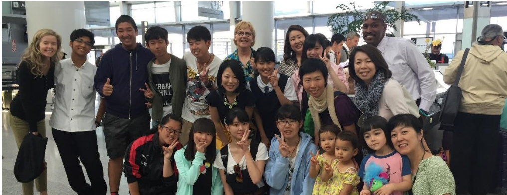
San Jose Family