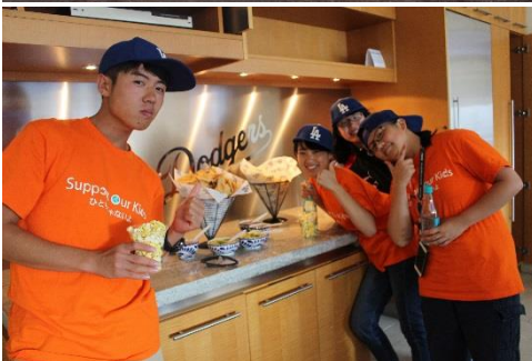
Watching the PIT vs LAD game!