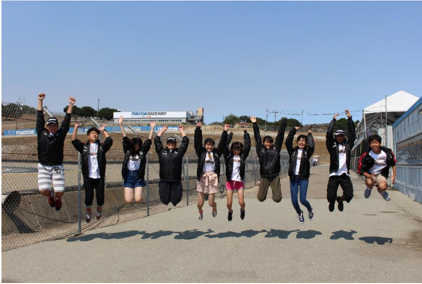
Mazda Raceway Laguna Seca