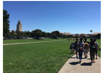
NASA, Google & Stanford University tours