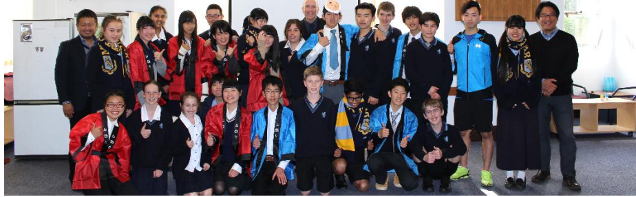
Support our Kies ひとりじゃないよ