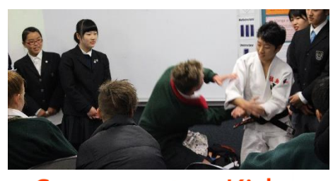
Support our Kies