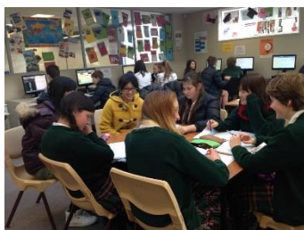
(Lincoln High School)