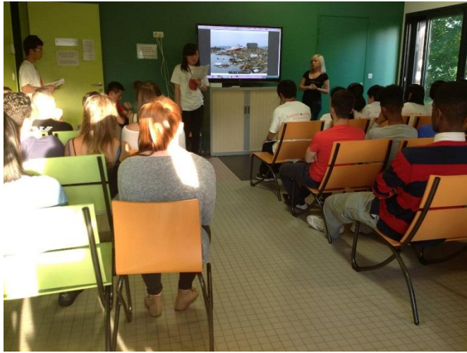
Earthquake presentation to local residents