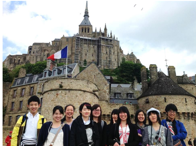
World Heritage Mont Saint-Michel