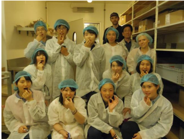
Industrial tour of France (Chocolate Factory)