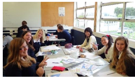
(Mount Albert Grammer School)