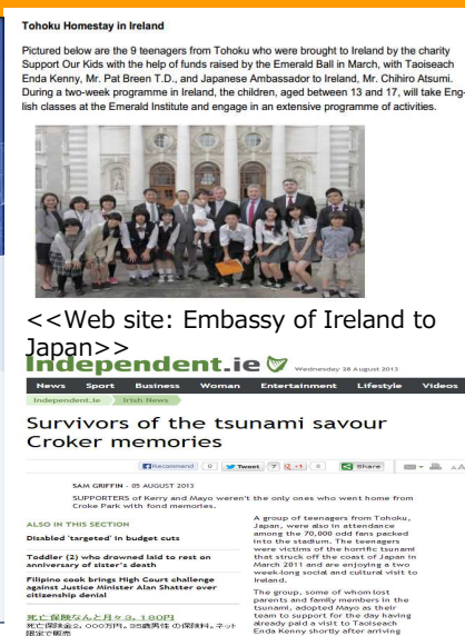
<<The INDEPENDENT on Web>>