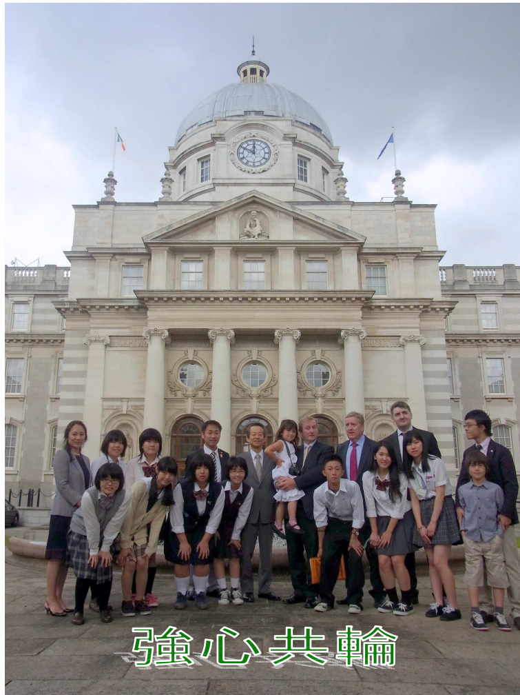
ceremonial photograph with Enda Kenny, the Taoiseach @the prime minister's office