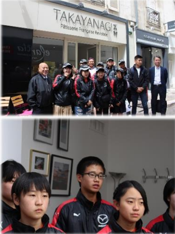
We attended Mazda's lunch party today. The menu consisted of Japanese food such as cutley curry, miso soup and rice. Although French dishes are delicious, nothing beats home from your own country.